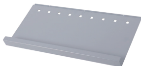
(P3) STEEL BROCHURE SHELF PROSPEKTBLAGEN